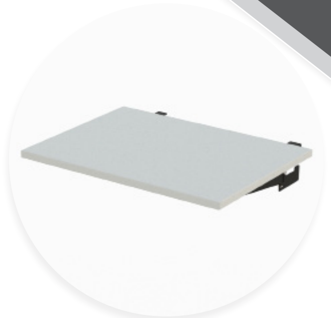
LAN STATION WOODEN SHELF

This Kendall Howard LAN Station shelf offers two installation options. Install it at a level horizontal position or flip the brackets and install it with a 10 degree angle. Includes a metal lip to secure paperwork and devices in place.