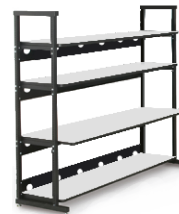
72" PERFORMANCE PLUS WORKBENCH