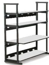
48" PERFORMANCE PLUS WORKBENCH