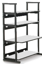
36" PERFORMANCE PLUS WORKBENCH

Pre-configured Performance Plus Lan Stations includes three 24" deep shelves, one 30" deep shelf, two side frame kits, four shelf support kits, and four back plates.