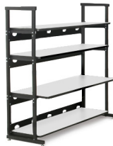
60" PERFORMANCE PLUS WORKBENCH