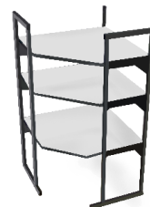
PERFORMANCE PLUS CORNER WORKBENCH